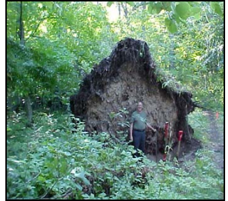
Picture taken by Joe Davis, R.S. with the Chippewa County Health Department, July of '06

STRANGE BUT TRUE A cockroach can live nine days without its head before it starves to death.